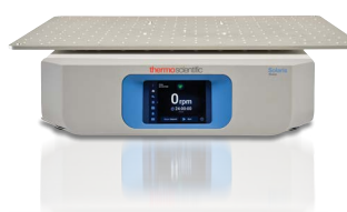
Solaris 4000 18x30