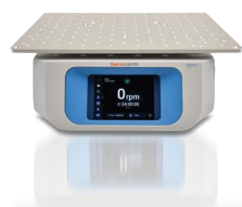
Solaris 2000 18x18

Choose from a variety of platforms to meet any application challenge.