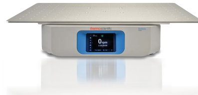
Solaris 4000 24x36