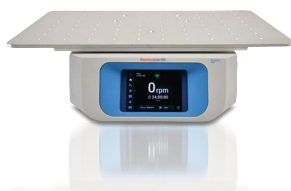
Solaris 2000 18x24